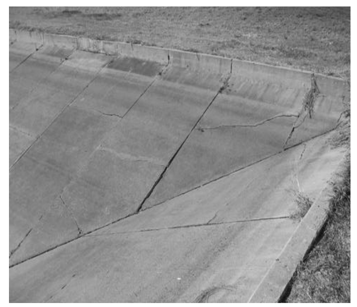
Reservoir joint and crack remediation

This information is supplied as an indicative reference only. Caution should be used where direct comparisons are to be made.