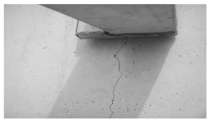
Crack in reservoir (top) and KIS treated (below)